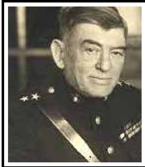
John A. Lejeune Commandant

illustrious men who have served as “Soldiers of the Sea” since the founding of the Corps.”