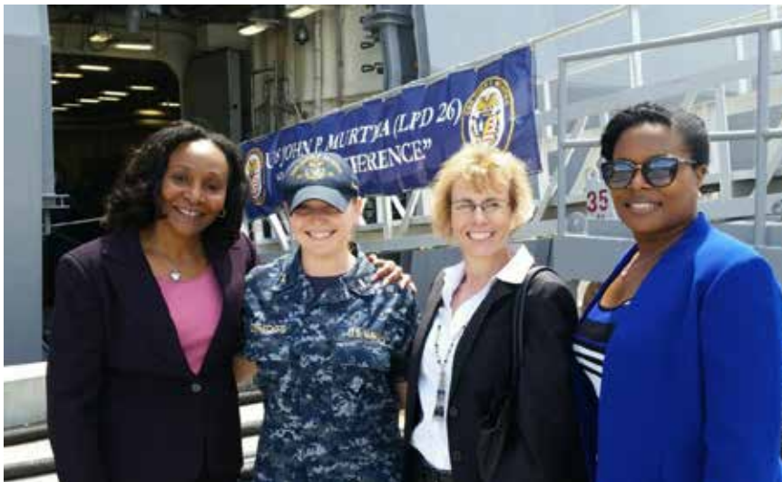
Photo: DACOWITS visits Naval Base San Diego

DACOWITS is one of the oldest DOD federal advisory committees and was established in 1951. The establishment followed the 1948 Women's Armed Services Integration Act, enabling women to serve as permanent, regular members of the Armed Forces in the Army, Navy, Marine Corps and Air Force. American women began serving in the U.S. military as nurses dating back to the 1800s. According to the Navy's official website, today women serve in every rank from seaman recruit to admiral in the U.S. Navy and hold nearly every job from naval aviator to deep-sea diver. Nineteen percent of the Navy's enlisted force are women, including 8% of all senior and master chiefs. Eighteen percent of the officer force and 11% admirals are comprised of women.