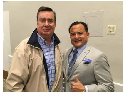
awareness of its programs it supports with awards presenation. our Maritme Forces in the San Diego Metro area.